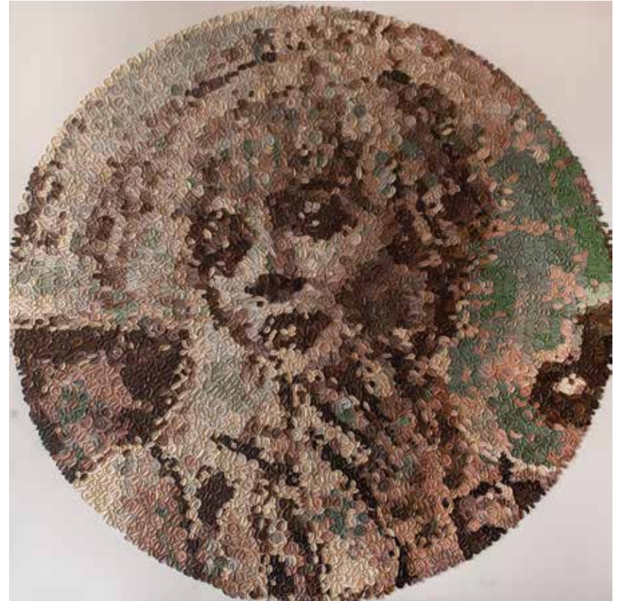
White , 2013 Oil on canvas 70.9 x 70.9 in / 180 x 180 cm © Murat Pulat