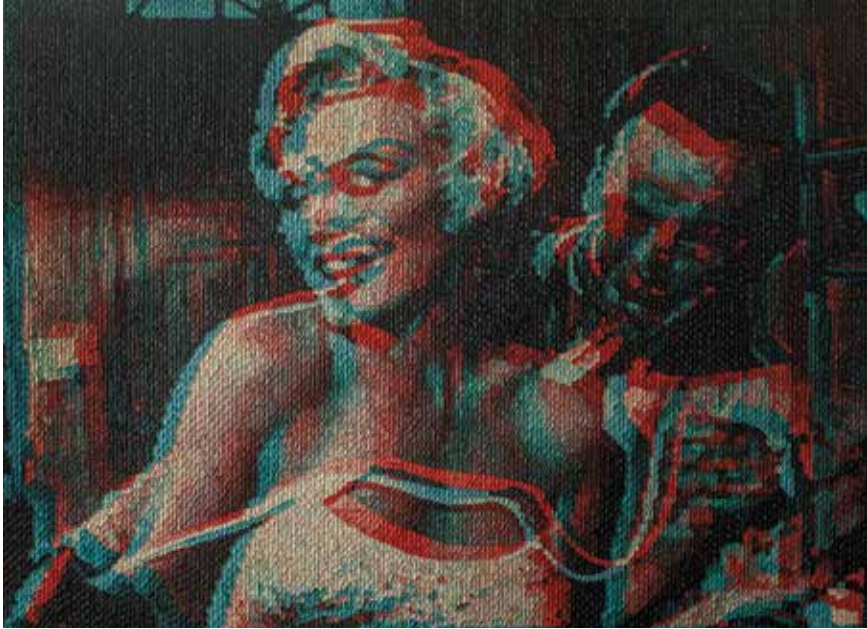
Aquarium , 2013 Oil on canvas 63 x 86.6 in / 160 x 220 cm © Murat Pulat