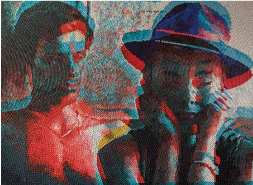
More , 2013 Oil On Canvas 63 x 86.6 in / 160 x 220 cm © Murat Pulat