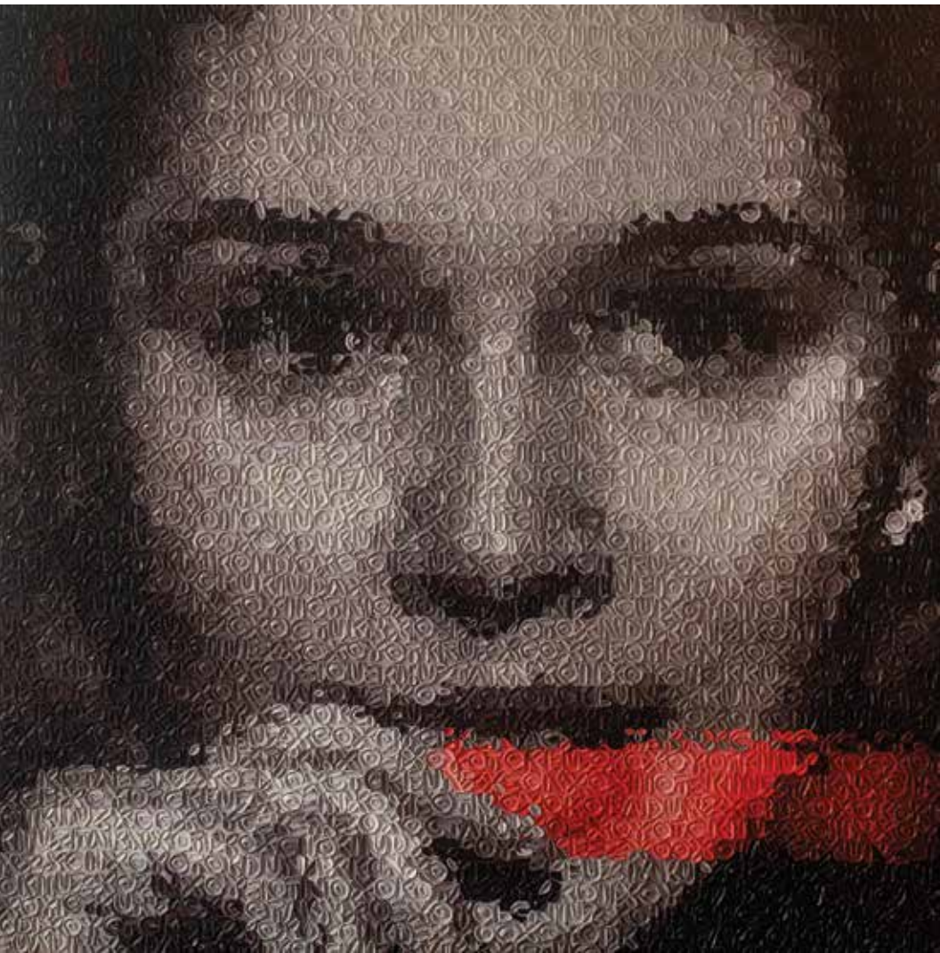
Innate Box , 2013 Oil on canvas 70.9 x 70.9 in / 180 x 180 cm © Murat Pulat