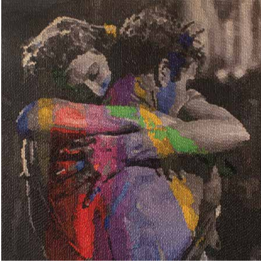
Mixtures , 2013 Oil on canvas 70.9 x 70.9 in / 180 x 180 cm © Murat Pulat