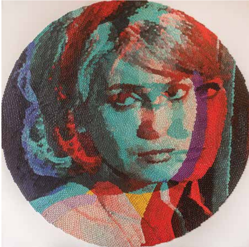
Middle C, B, A , 2013 Oil on canvas 70.9 x 70.9 in / 180 x 180 cm © Murat Pulat