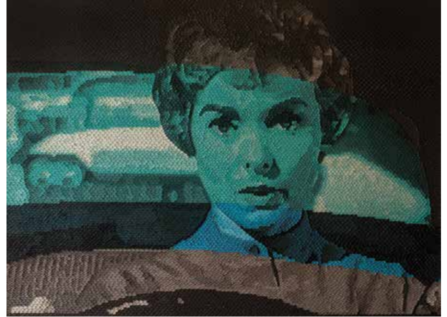
Glass Studio , 2013 Oil on canvas 63 x 86.6 in / 160 x 220 cm © Murat Pulat