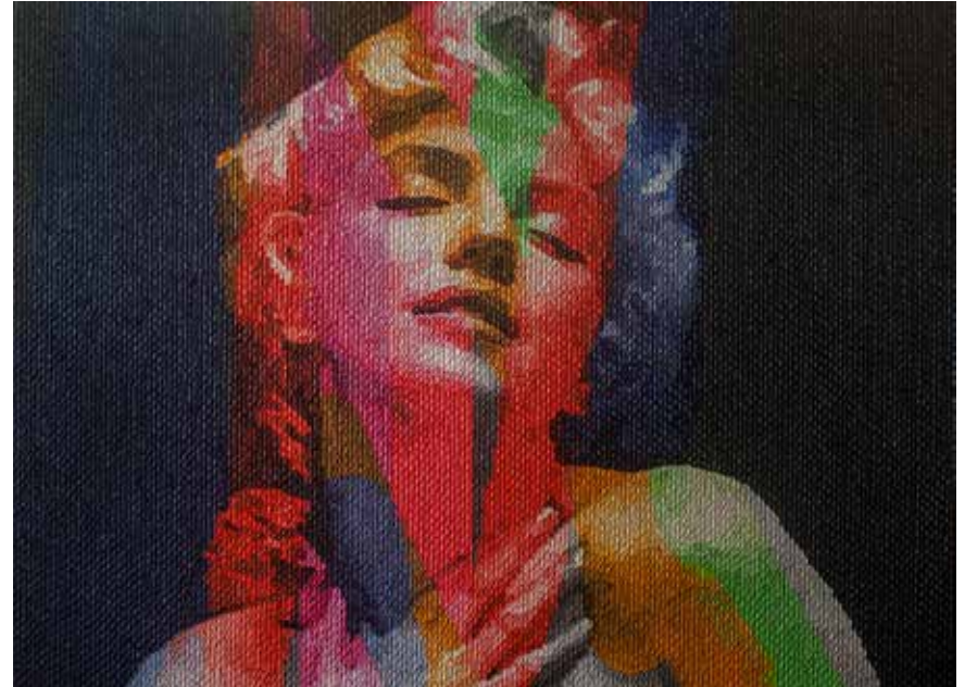
Be Chilly , 2013 Oil on canvas 63 x 86.6 in / 160 x 220 cm © Murat Pulat