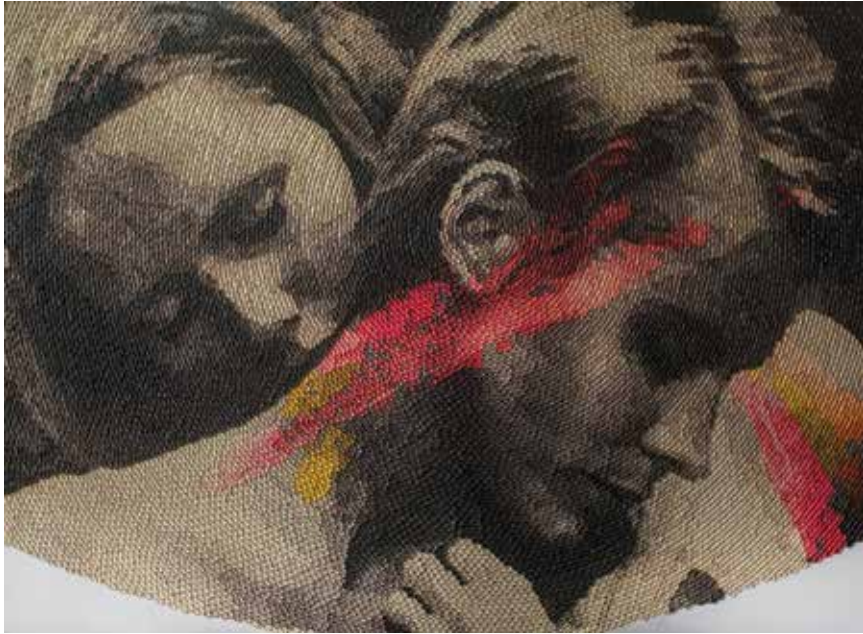
Exterior , 2013 Oil on canvas 63 x 86.6 in / 160 x 220 cm © Murat Pulat