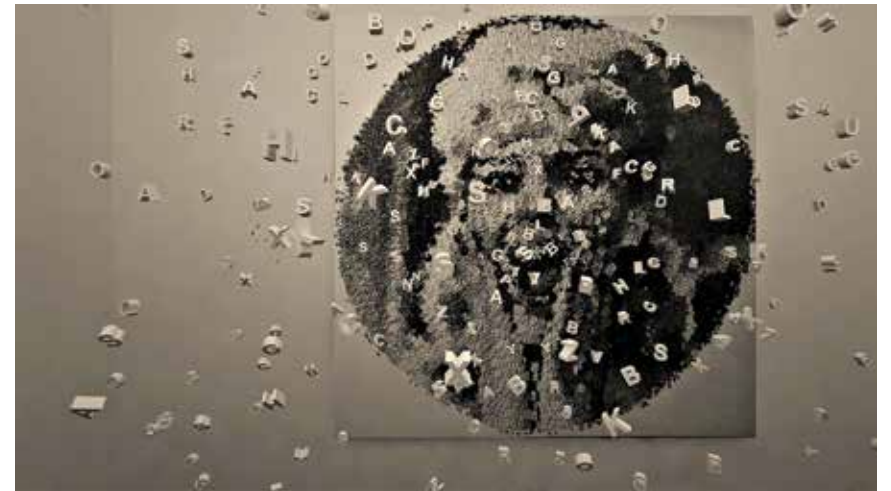
Schizoid/Surface , 2013 Mixed media Dimensions variable © Murat Pulat